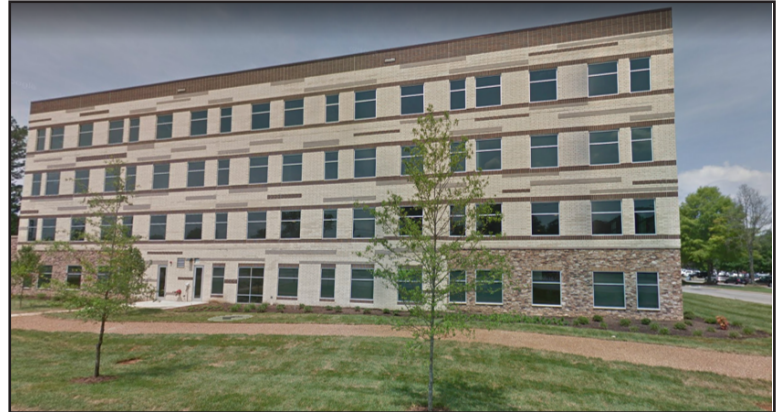
View of Building C from Gunbarrel Road

Turn left at the first median opening, then straight into the parking lot of Building C.